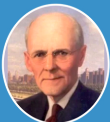
Rtn. Paul Harris Founder